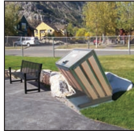
Decorative poly siding looks great with zero upkeep.