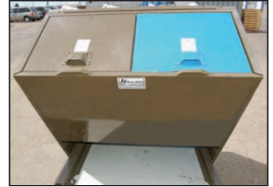
Combination collection for waste and/or recyclables.

Side-hinge unloading door for ease of servicing.