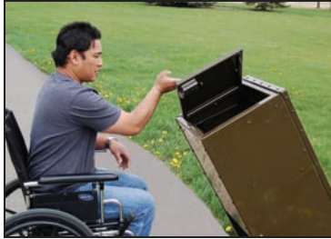
Handicapped accessible with optional side-hinge loading door.