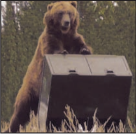
The industry standard for bear proof containment.